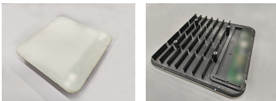
Figure 2. Developed NTN planar antenna (approximately 45 cm square) Left: front view, Right: back view

Furthermore, the newly developed NTN planar antenna was integrated with a modem and other components, and operation was confirmed as a satellite communication user terminal. This demonstrated that a much lighter satellite communication user terminal can be realized, falling within the payload capacity of widely used industrial drones, and can be directly mounted and operated on a wide range of mobility platforms, including drones and vehicles, thereby expanding the range of applicable mobility platforms.